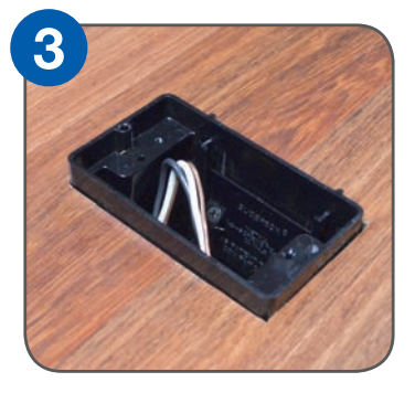
Install desired floor material around the raised floor box. The raised box allows for easier installation by contractors