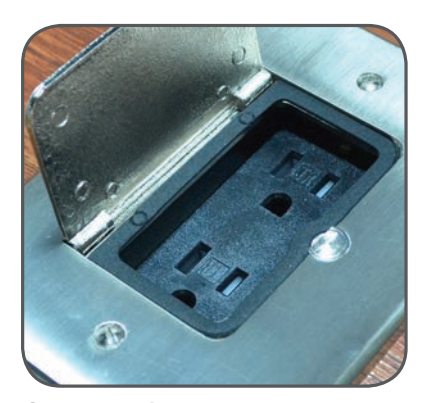
Convenient flip-lid design available in three cover finish options, along with a decorator style device.