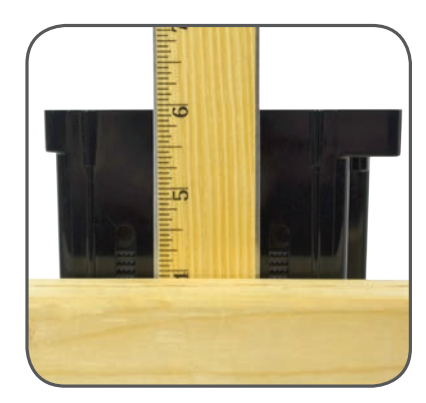
*Additional (max) substrate thickness is achieved when the slider plate is down and the box is installed at its highest position on the floor joist.