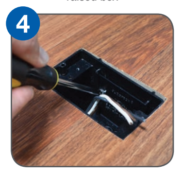
Adjust box height to achieve a flush position; wire the included device and install the gasket and cover