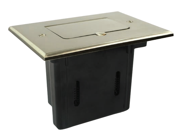
U.S. Patents #7,855,338 - #6,365,831