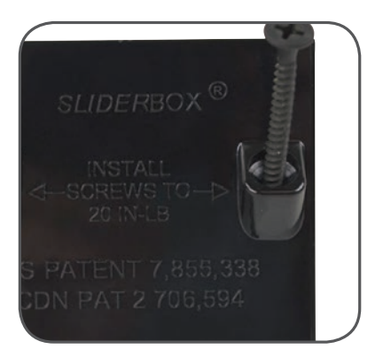
Patented slider plate holds screws in ready position, allowing for easy one-person installation.