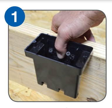
*Find and install floor box on solid floor joist; mount with slider plate in the "up" position