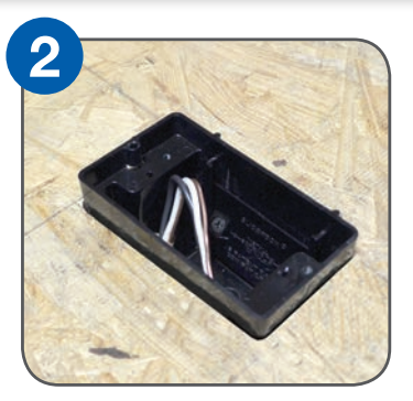
Move floor box in highest position by loosening slider plate screws, install sub floor around raised box